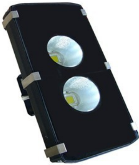
Figure 1. The 60° Light