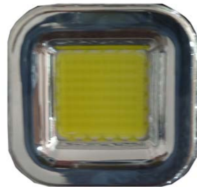
Figure 4. Integrated LED Light Source