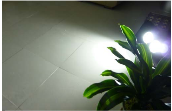
Figure 5. Lighting Effect

Outdoor applications where resistances to water, corrosion, shock, dust are required and strong natural lighting is needed, such as marine lighting, tunnel lighting and other outdoor applications, etc.