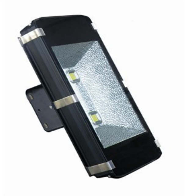
Figure 2. The 120° Light