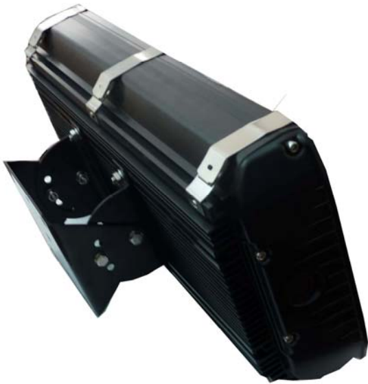
Figure 3. Back View of the Light